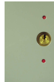
Color coded lock panel identifies key number